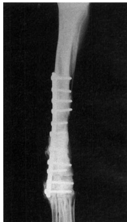
FIG 2. Case 10, 10 months after surgery. Allograft appears well incorporated and a radiodense pattern is prevalent

six months, 35 per cent (6/17 dogs; one was excluded because of tumour-unrelated death) at 12 months, 23 per cent (4/17 dogs) at 18 months and 19 per cent (3/16 dogs; one more dog was excluded because of tumour-unrelated death) at 24 months.